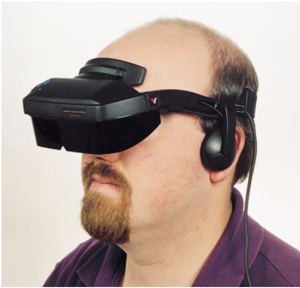
Figure 1. The virtual image audiovisual eyeglass system used in the study.

ity associated with pain. 13 One of these, the Fear of Pain Questionnaire-III, or FPQ-III, is a 30-item instrument that measures pain-related fear in a traitlike fashion, so there are no assumptions about prior pain experiences. 13,14 It has demonstrated utility in dental behavioral science research 15 and predictive ability in terms of actual avoidance behavior. 13