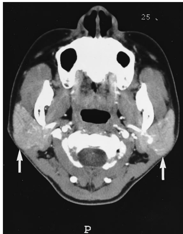
Figure 2. Computerized tomography scan with contrast of moderately enlarged parotid glands (arrows).

At the SGC, we are aware that a serum electrolyte study is an important tool that can be used to diagnose multiple vomiting episodes as the cause of parotid gland swelling. 21 People with BN lose large quantities of fluid 1 owing to purging and the often-adjunctive use of diuretics and laxatives. To preserve extracellular fluid volume, hyperaldosteronism develops and increases sodium resorption with accompanying bicarbonate from the kidney tubules. Serum potassium is lost when it is secreted into the kidney tubules in exchange for the aldosterone-enhanced sodium